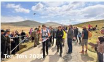
Ten Tors 2024