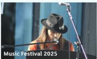
Music Festival 2025