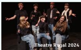
Theatre Royal 2024